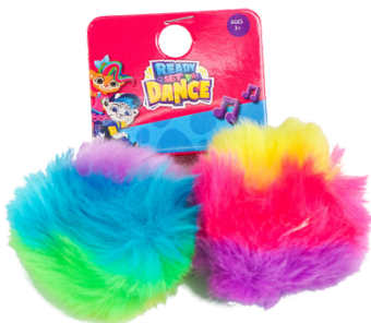
POM POM HAIR TIES $10/PAIR