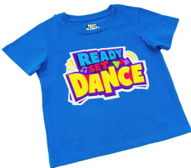
READY SET DANCE T-SHIRT $30 (to be worn with own black shorts)