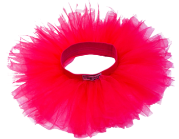
TULLE SKIRT $35