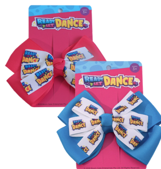
HAIR BOW $10