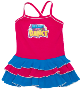
DRESS $55 (includes a pair of frill socks)