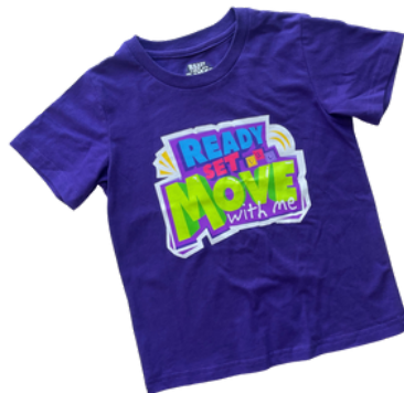
READY SET MOVE T-SHIRT $30